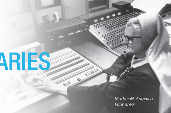
Mother M. Angelica Foundress

The Newsletter for EWTN Media Missionaries Winter Issue 2023/24 Volume XXVIII No.16